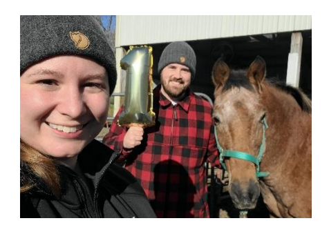
Celebrating 1<sup>st</sup> year owning Bella!