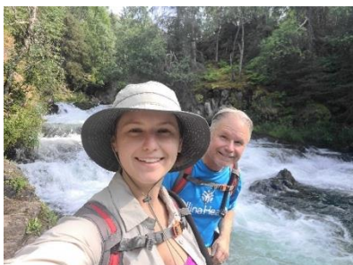
Seeing the salmon run in the Russian River

After parting ways with Amanda and the RV in Anchorage, Shannon & I continued a car camping adventure the next 7 days. We traveled back to the Kenai to camp, hike, kayak, & sight see. We sea kayaked in very calm waters after taking a ferry from Homer AK. We hiked along the salmon runs on the Russian River and other spots too. Then we spent a day hiking the Portage Glacier and visited Whittier and the Prince William Sound. Our last days were spent north of Palmer, where we camped and hiked in a non-touristy area we had been told of. The Hatcher Pass and Independence Gold Mine areas offered beautiful hikes and fun! It was a great trip that we were lucky to go on. We will cherish it forever!