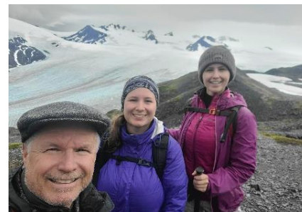
All smiles hiking up to the Harding Ice Field

After parting ways with Amanda and the RV in Anchorage, Shannon & I continued a car camping adventure the next 7 days. We traveled back to the Kenai to camp, hike, kayak, & sight see. We sea kayaked in very calm waters after taking a ferry from Homer AK. We hiked along the salmon runs on the Russian River and other spots too. Then we spent a day hiking the Portage Glacier and visited Whittier and the Prince William Sound. Our last days were spent north of Palmer, where we camped and hiked in a non-touristy area we had been told of. The Hatcher Pass and Independence Gold Mine areas offered beautiful hikes and fun! It was a great trip that we were lucky to go on. We will cherish it forever!