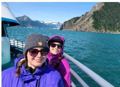
Kenai Fjords scenic and sunny boat tour