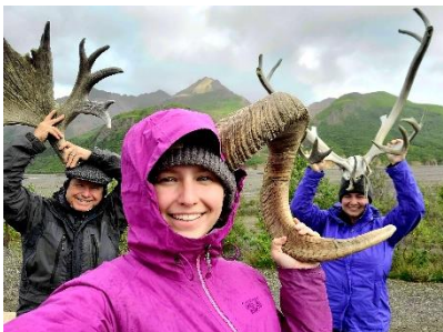
Moose, Dall sheep, & Caribou horns in Denali

We then drove to Seward for a 6 hour scenic boat tour of a portion of the Kenai Fjords National Park. We saw whales, otters, puffins, and more. The next day, we hiked to the Harding Ice Field of Seward Glacier. Awesome scenery and really great to show the kids more of nature's beauty. Even though the weather wasn't perfect we enjoyed ourselves.