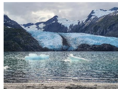
Ice chunks floating at Portage Pass Trail

The next few months were very routine with lots of togetherness. Amanda found a wedding dress, visited her aunt's farm, traveled to Madeline Island for a reunion with PA classmates, and was able to meet some of Tilly's siblings at a nearby park. She also went to the state fair three times this year - mini state fair in May, regular fair in August, and holiday lights in December! We all got to hang out with friends and play mostly outdoors.