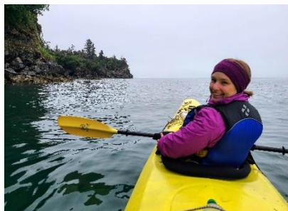
Sea kayaking near Kachemak Bay State Park, AK