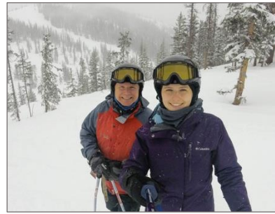
Enjoying 1 of 11 ski days on road trip.