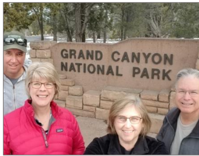
Grand Canyon(GC) trip from Phoenix.