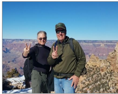
Successful return hike from GC base!