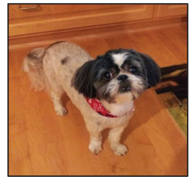
Missing our amazing dog, Max

Wishing you and yours a happy and healthy Holiday season and New Year!