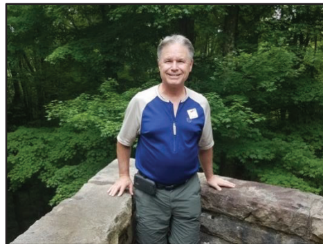
Cancer free and glad to be here!